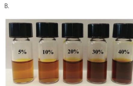
Figures 2A and 2B: A. UV-Vis absorption spectra of colloidal solution of AgNPs with different concentrations of green tea leaf extract (5% to 40%). B. Visual images of the AgNPs with different concentrations of tea leaf extracts at room temperature